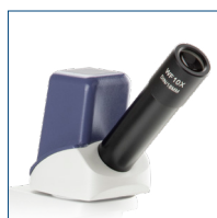
Digital monocular head