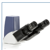
Digital binocular head