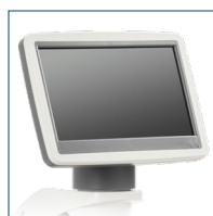
Digital LCD head