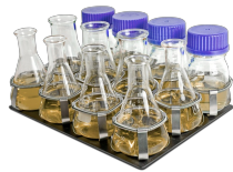
P-12/100 BS-010108-EK platform

Universal platform with adjustable bars for different types of flasks, bottles, and beakers with silicone mat.