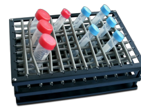
P-16/88 BS-010116-BK platform

Platform with spring holders for up to 88 tubes up to 30 mm diameter (e. g. 10 ml, 15 ml, 50 ml tubes).