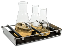
UP-12 BS-010108-AK platform

Universal platform with adjustable bars for different types of flasks, bottles, and beakers with silicone mat.