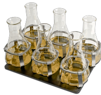
P-6/250 BS-010108-DK platform